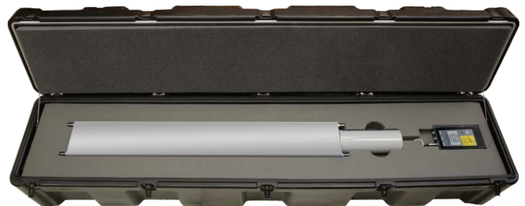
Highly sensitive gamma radiation counting monitor: BDRM-05 (1 unit)