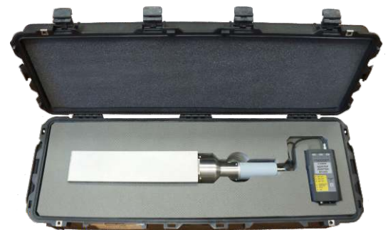
Highly sensitive gamma radiation monitor: BDKG-28 (1 unit)